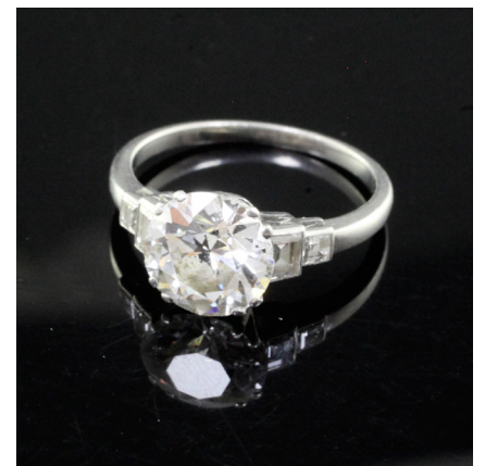
2.7ct diamond ring £10,000