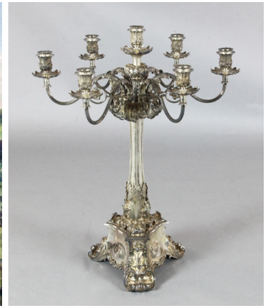
Victorian silver candelabrum £5,800