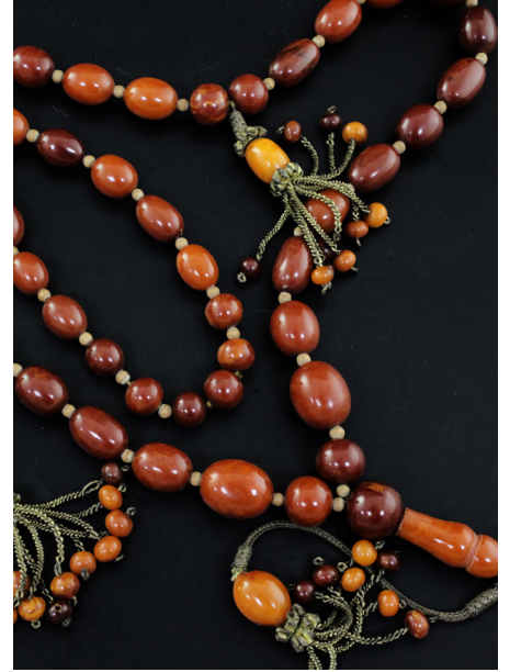
Persian amber bead necklace £22,000

The Spring sale offered a diverse selection of antiques and collectables ranging from rare ceramics to violins and fountain pens. The top lot was an antique amber bead necklace that sold to a Turkish buyer after a lengthy bidding battle. Equally fought over was a Flemish oil on copper of Diana at rest. A bidder travelled over from Belgium to secure this lot but was thwarted at £16,000 by online bidding from Germany. Elsewhere the remarkable Dennis G. Rice Collection of early Derby porcelain achieved a hammer total of £100,000. Highlights included three extremely rare examples of a porcelain manufactory that he named, after this very figure, as 'The Girl-on-a-Horse Factory'. Otherwise known as Compass Marked or 'Transitional Derby' there are only 21 known examples, four of which are in London Museum Collections.