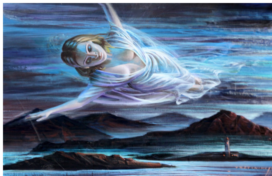
Vladimir Tretchikoff (1913-2006) The Dream £16,000