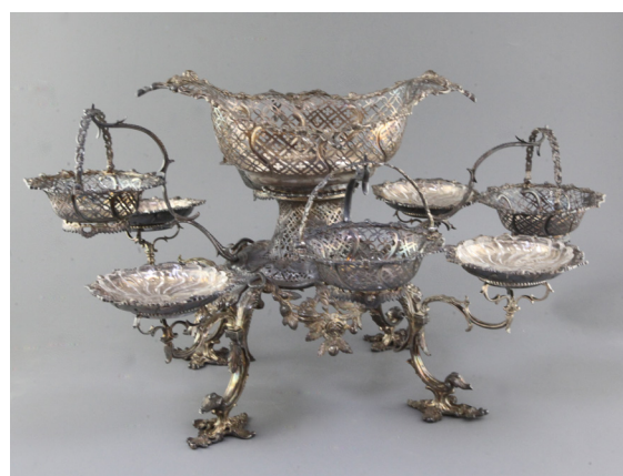
George III silver epergne by Thomas Heming £11,000