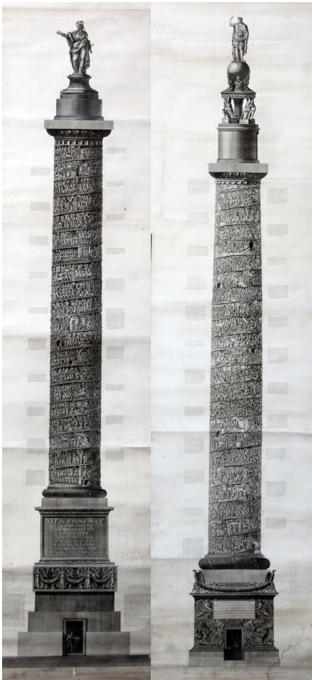
Huge Piranesi engravings £12,500