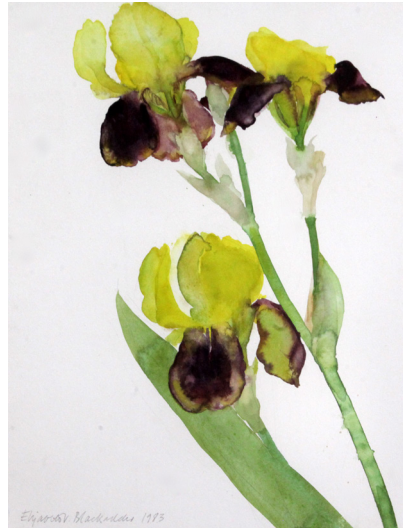
Dame Elizabeth Blackadder £5,400