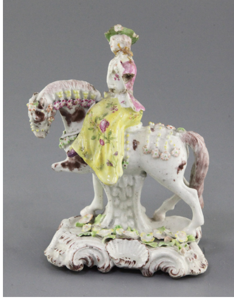
The original 'Girl-on-a-Horse group' £13,000