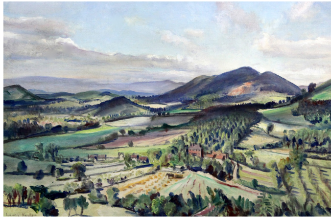
Dame Laura Knight - Malvern Hills £12,000