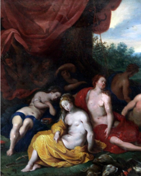
17th Century Flemish School £16,000