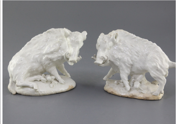
Rare Derby 'dry-edge' figures of wild boar c.1750-55