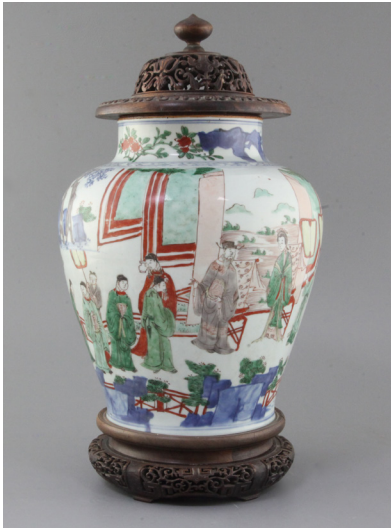
Chinese wucaï jar £7,500