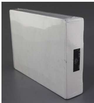
Sealed Montblanc pen £16,000

The Spring sale offered a diverse selection of antiques and collectables ranging from rare ceramics to violins and fountain pens. The top lot was an antique amber bead necklace that sold to a Turkish buyer after a lengthy bidding battle. Equally fought over was a Flemish oil on copper of Diana at rest. A bidder travelled over from Belgium to secure this lot but was thwarted at £16,000 by online bidding from Germany. Elsewhere the remarkable Dennis G. Rice Collection of early Derby porcelain achieved a hammer total of £100,000. Highlights included three extremely rare examples of a porcelain manufactory that he named, after this very figure, as 'The Girl-on-a-Horse Factory'. Otherwise known as Compass Marked or 'Transitional Derby' there are only 21 known examples, four of which are in London Museum Collections.